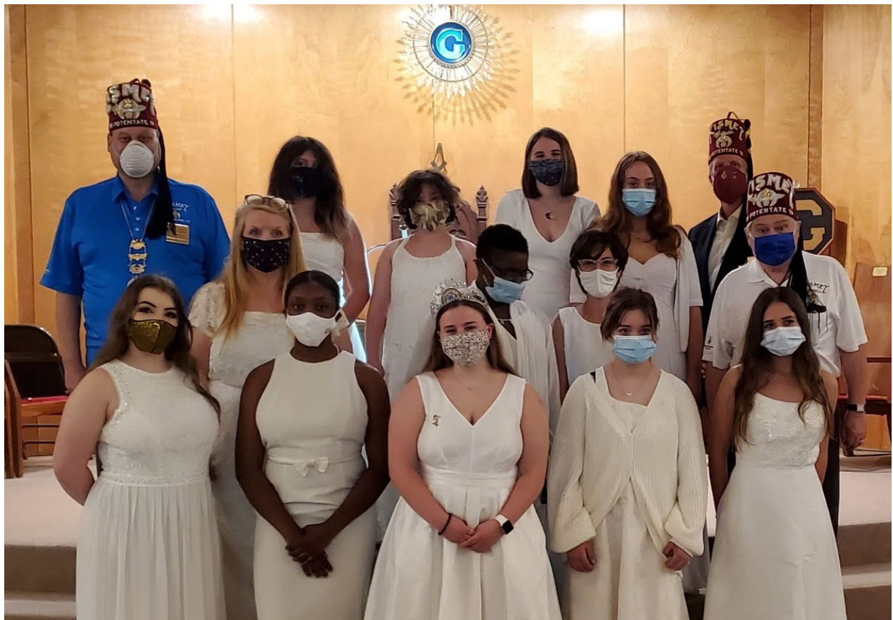
Kismet Shriners were Honored Guests of The Bellmore Assembly of Rainbow Girls During Their Recent Degree