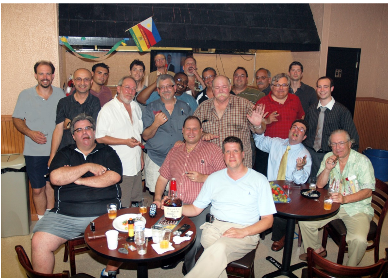
Blast from the past... One of Kismet Cigar Club's first meetings waaaayyyy back in 2011