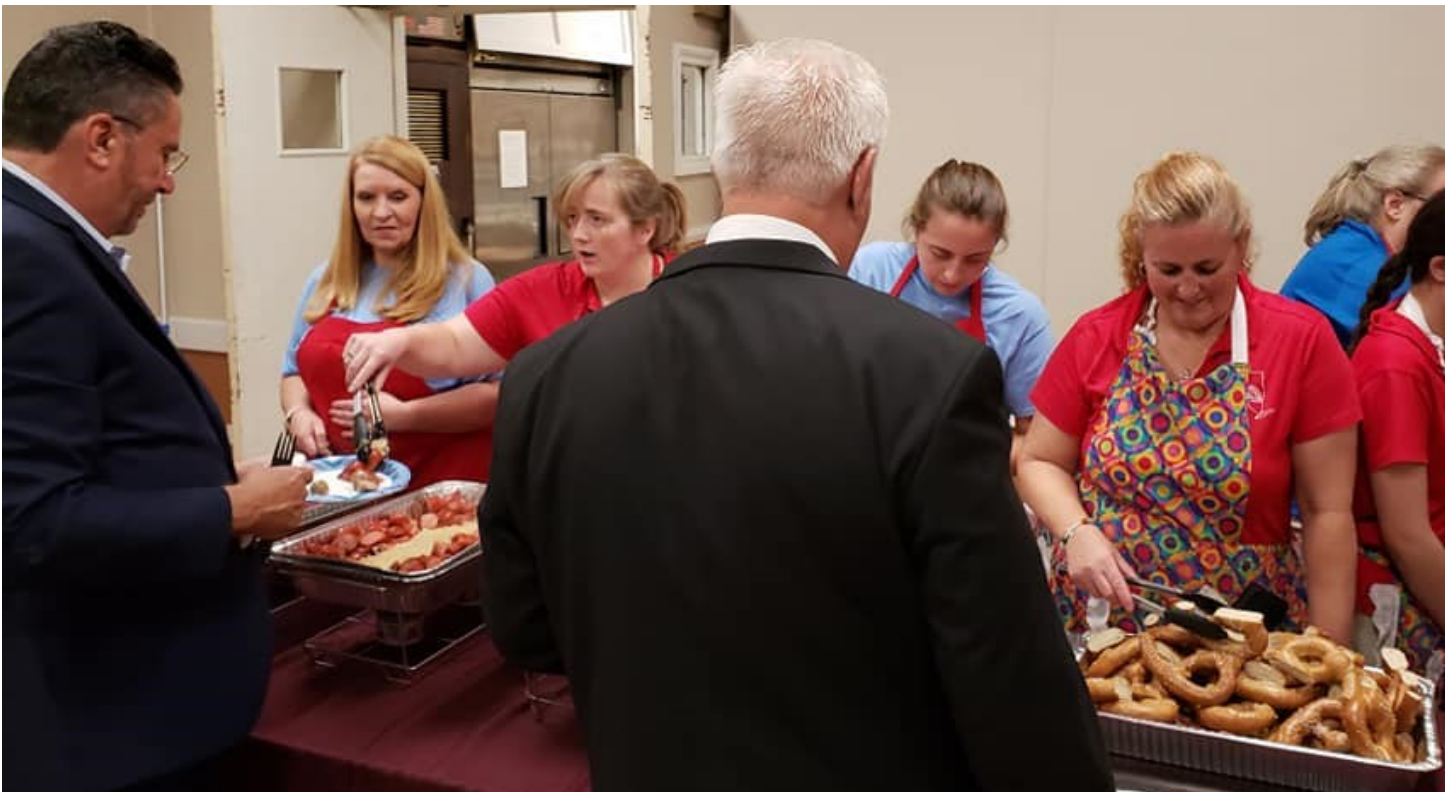
The Chefs prepared Brats, Cabbage and Pretzels...well worth the wait !!