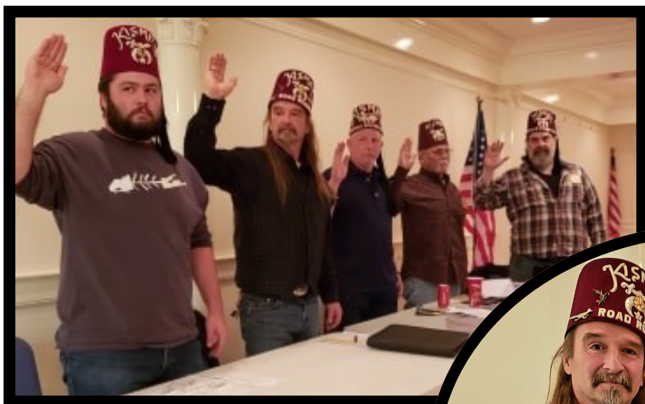
Above: The newly elected officers of the Suffolk County Shrine Club being sworn in for the coming year.

As the newly elected president of the Suffolk County Shrine Club, I'd like to thank all the nobles and officers of the club for allowing me to serve as president. This coming year will be a great one for our club, we will be planning a few events and trips through out the year and always remember why we became Shriners; we are Shriners to help the ones in need of our help the most, the children .