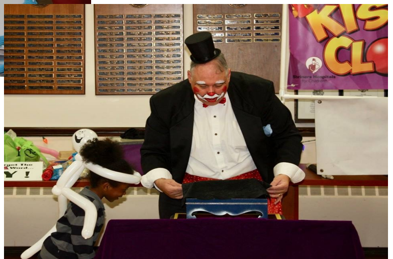
Clowning for Kids at the Farmingdale Firehouse Kismet Shrine Children's Holiday Party