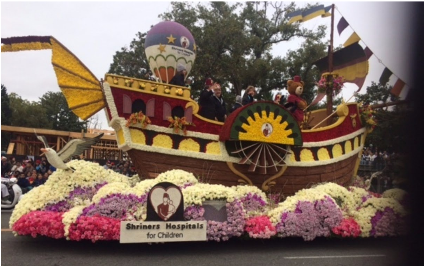
Shriners Hospitals for Children was proud to participate in the 128th Rose Parade® for the seventh consecutive year. This year, nine representatives were part of the 2017 float: Anything is Possible.