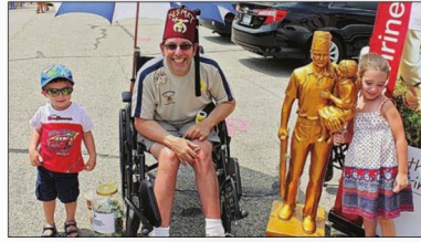
Shriners Hospitals for Children help kids with major health issues regardless of their parents' ability to pay. Kismet Shrine will host a silent auction to raise funds for their transportation unit.

Up until four years ago, Shriners did not