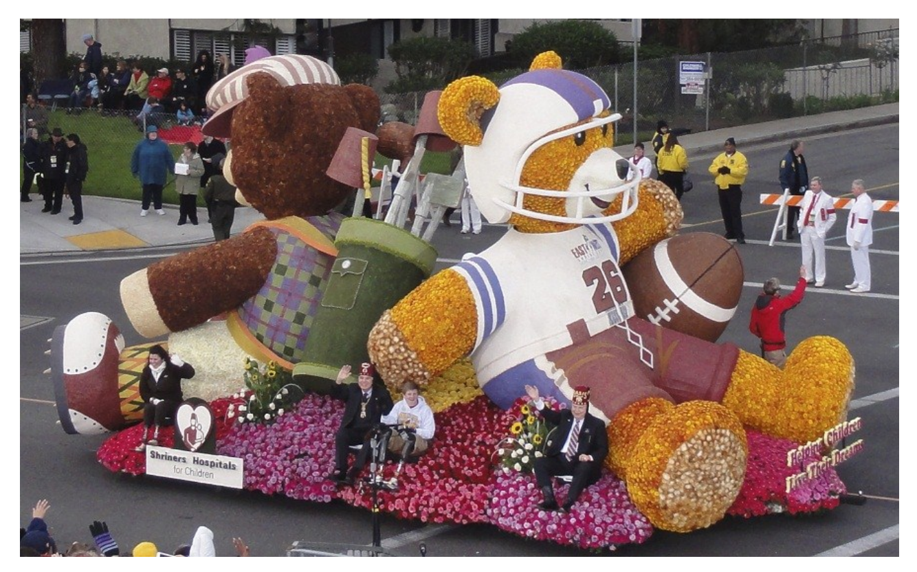
Shriners International's Float at the Rose Bowl Parade 2013