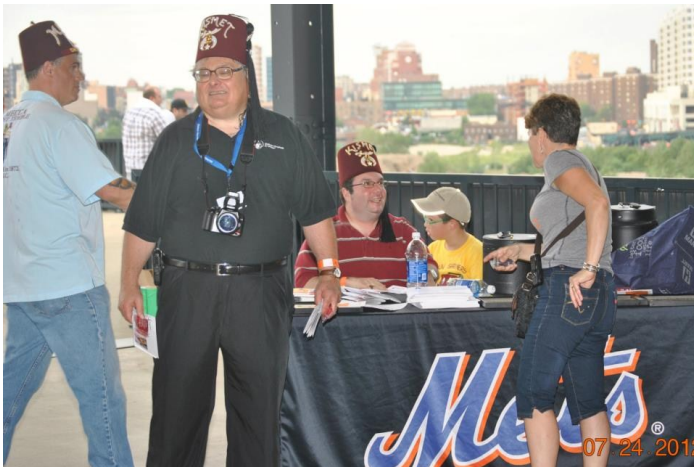
Volunteers made this event work.