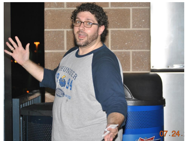
Am I having a good time? You bet!