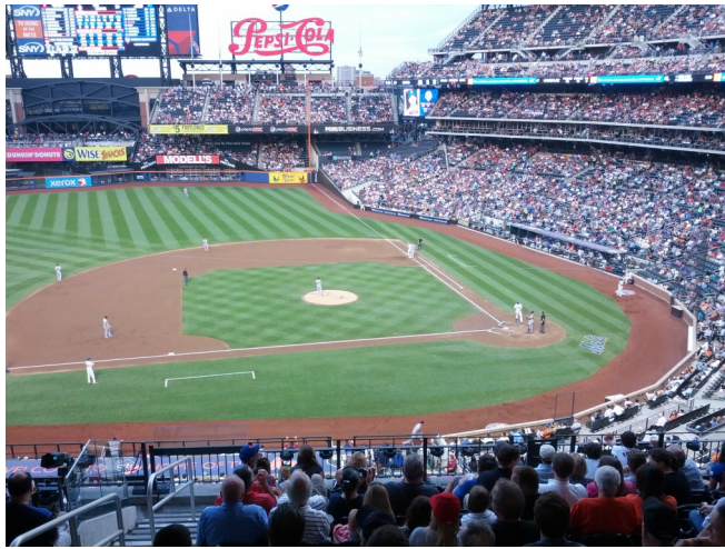
All of these fans now know who Shriners are