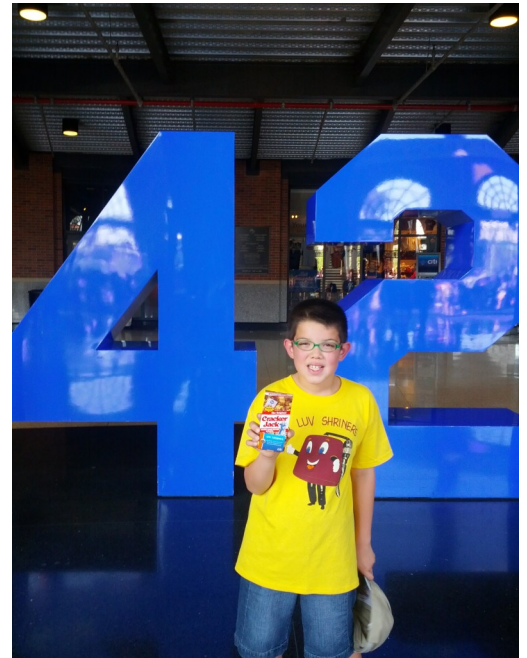
What's a baseball game without Craker Jacks?