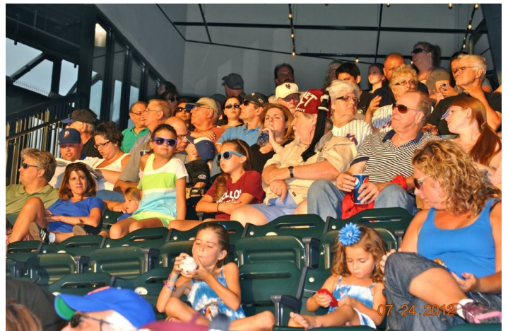
Some of the Kismet Family enjoying the game