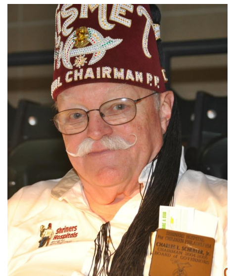
Proud to be a part of the Kismet team

See all of these photos and more at KismetShriners.org