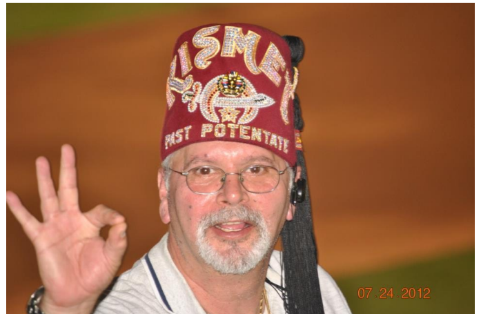
Life is good.