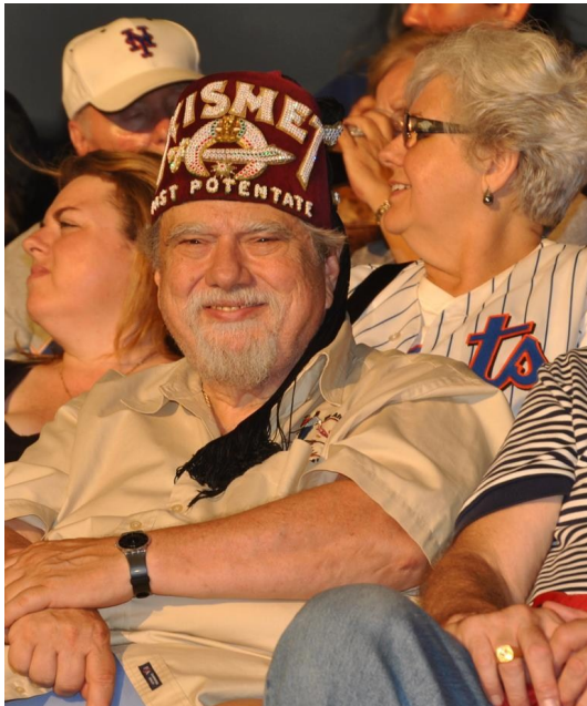
What's not to smile about?