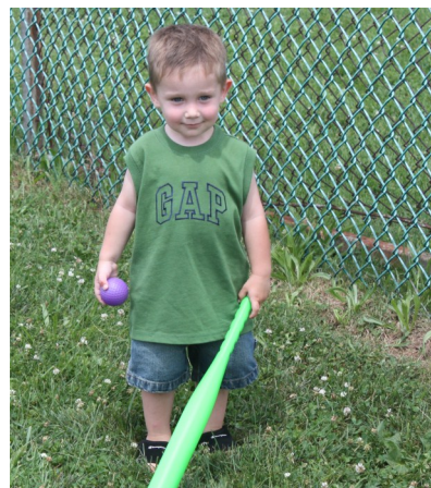
I'm ready for the Met game!