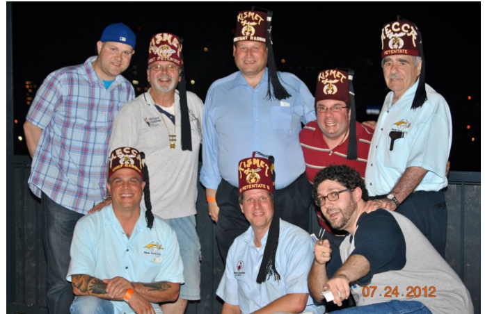
Your friendly neighborhood Shriners!