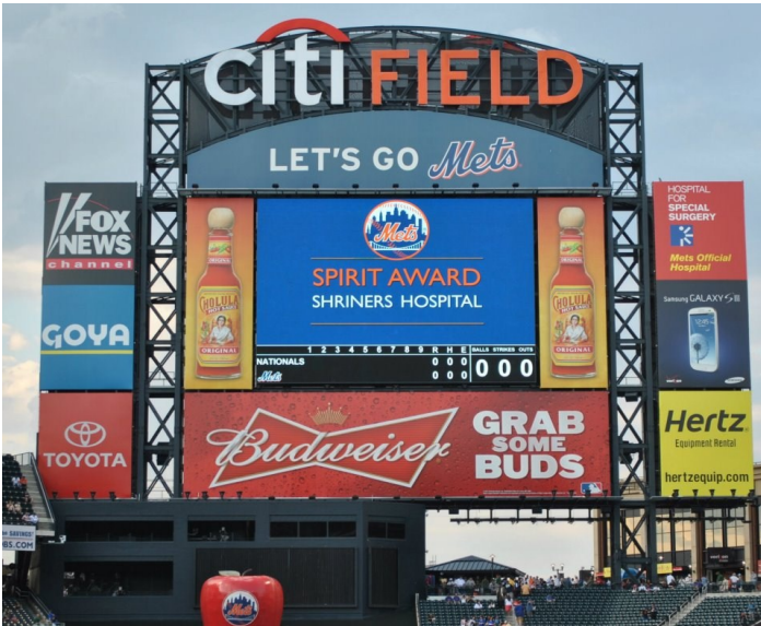
The Spirit Award will be presented to the hospitals

If you were there, you saw it in person—Shriners Hospitals got the word out with the help of Nobles and friends from Kismet and Mecca Shrines. If you missed it... well you missed the first of what will become one of our biggest regular fund raising events. We're already planning on next year and hope you are planning to come!