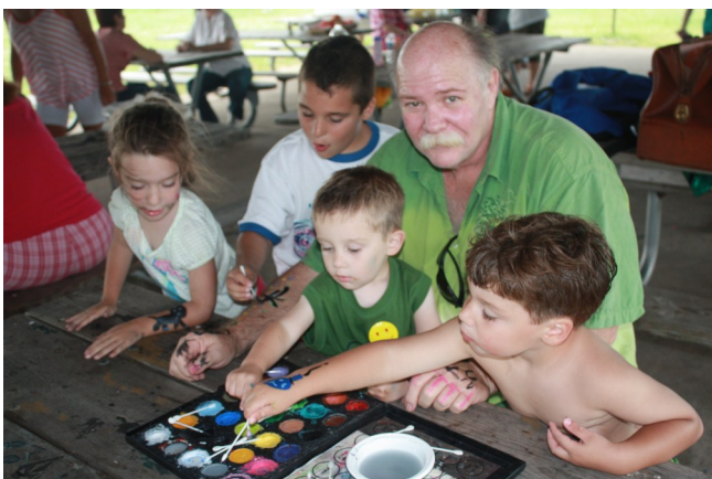
Silly Pennybags is always there for the kids