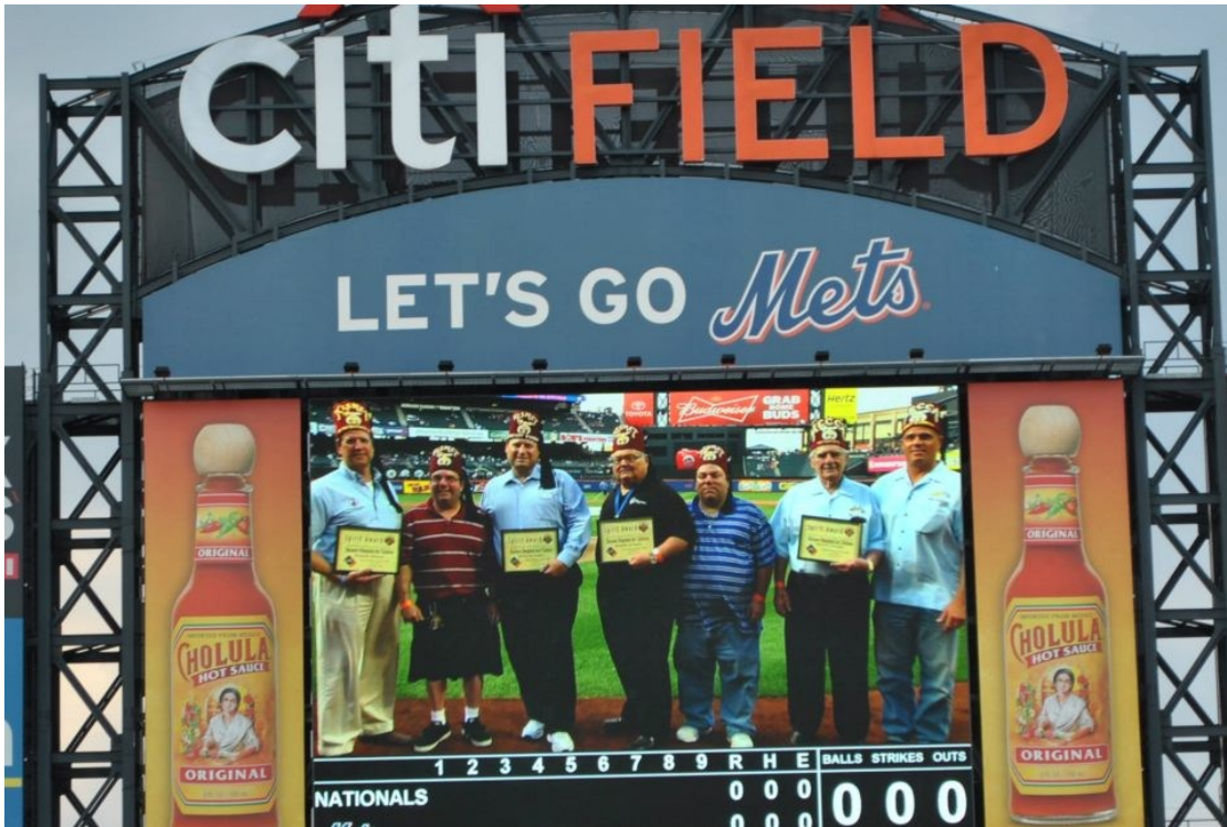
Kismet and Mecca Shrine Receive the Met's Spirit Award On Behalf of Shriners Hospitals for Children (Boston & Philadelphia)