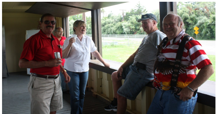
Where there's good food and good friends, they'll be laughter