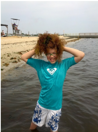
Like my new hair style?