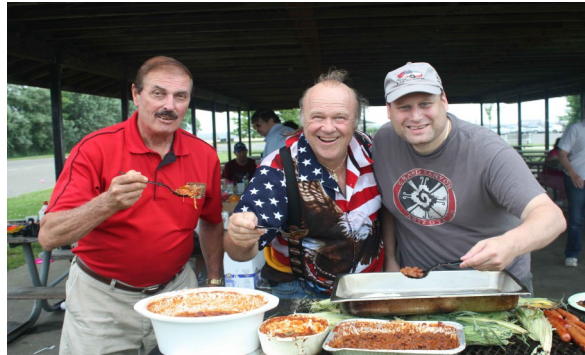
The Chili Champions