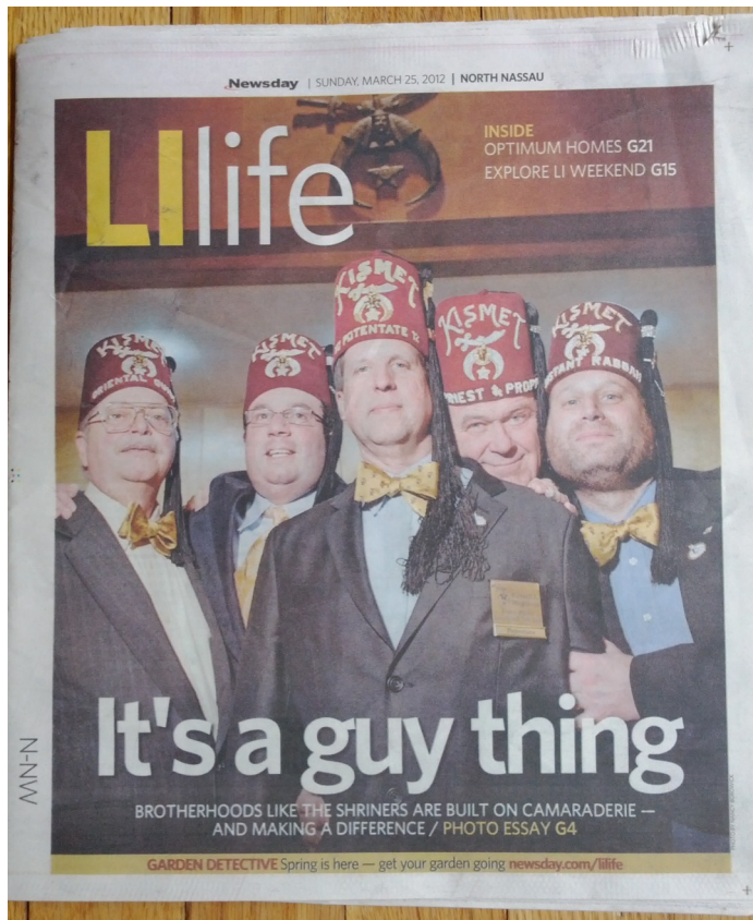
Long Island Newsday puts Kismet Shrine on the front page of their LI Life section