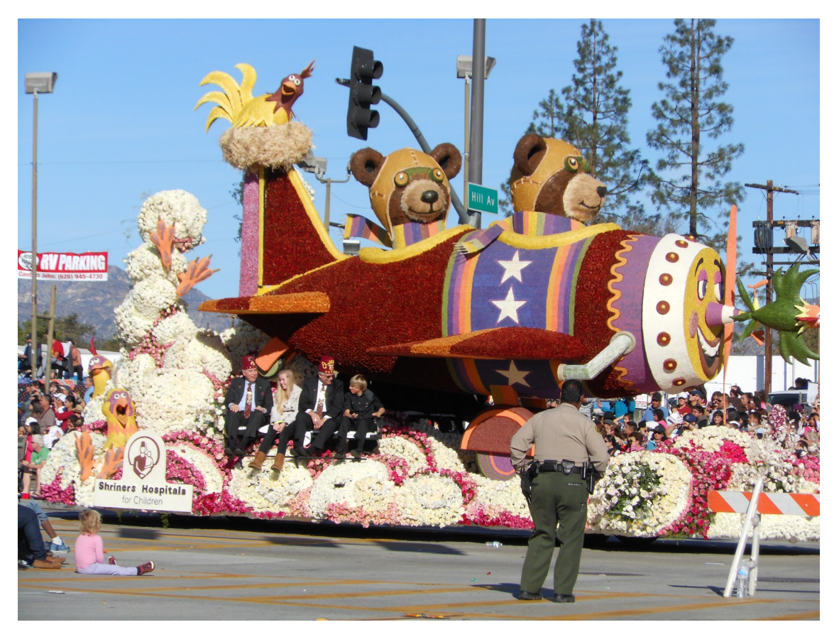
Shriners Hospitals for Children—Rose Bowl Float 2011