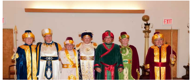
The Hajii in all their colorful glory