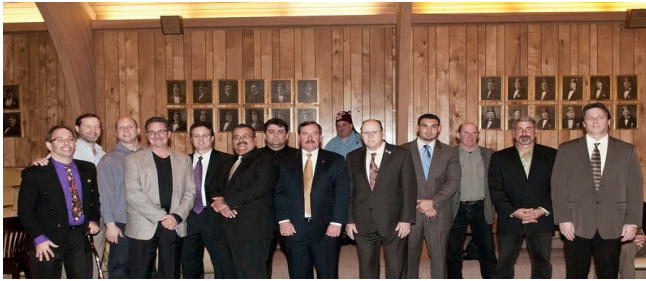
Our newest Nobles—Welcome one and all