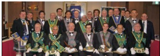
Hang Yang Lodge Installation—2011