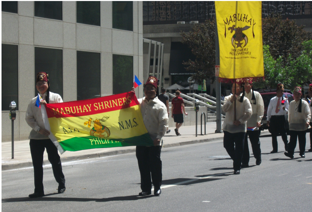
Imperial Session 2011 Welcomes Mabuhay Shriners, Philippines

Kismet Shrine 18 West Nicolai Street Hicksville, NY 11801-3806