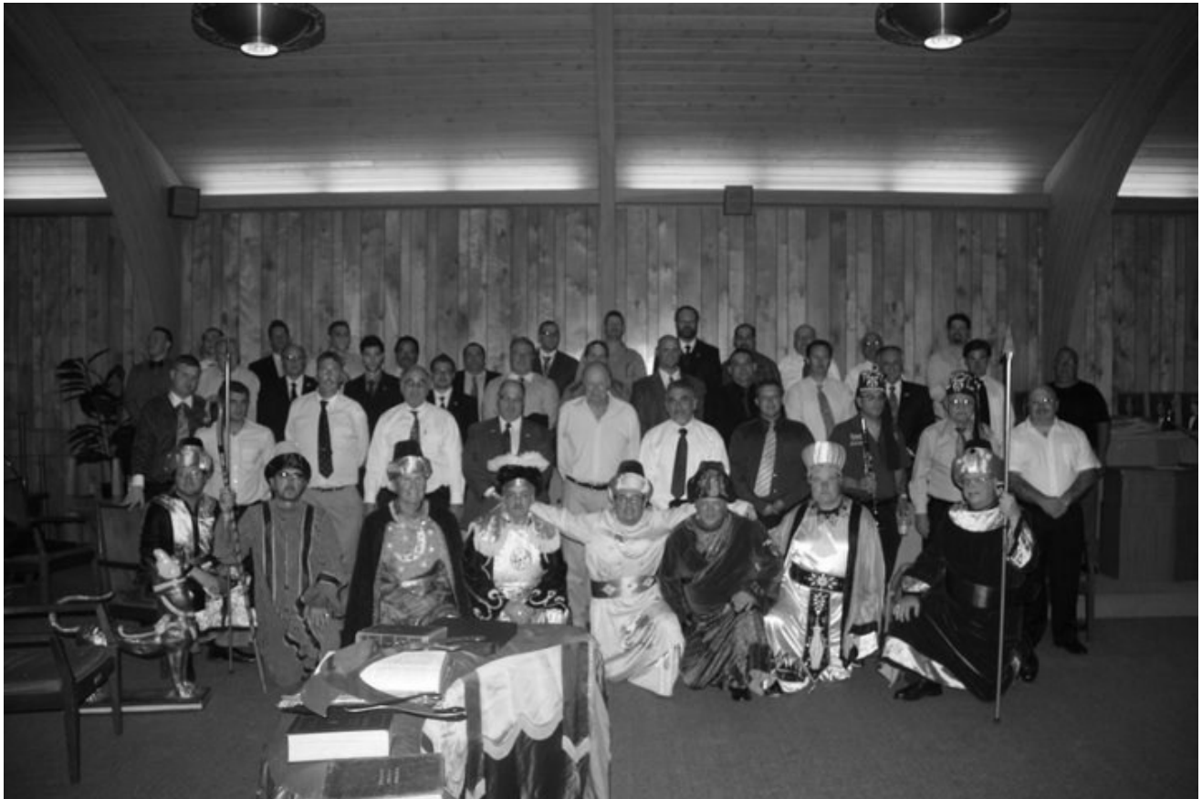
Welcome—Kismet's Newest Nobles

Kismet Shrine 18 West Nicholai Street Hicksville, NY 11801-3806